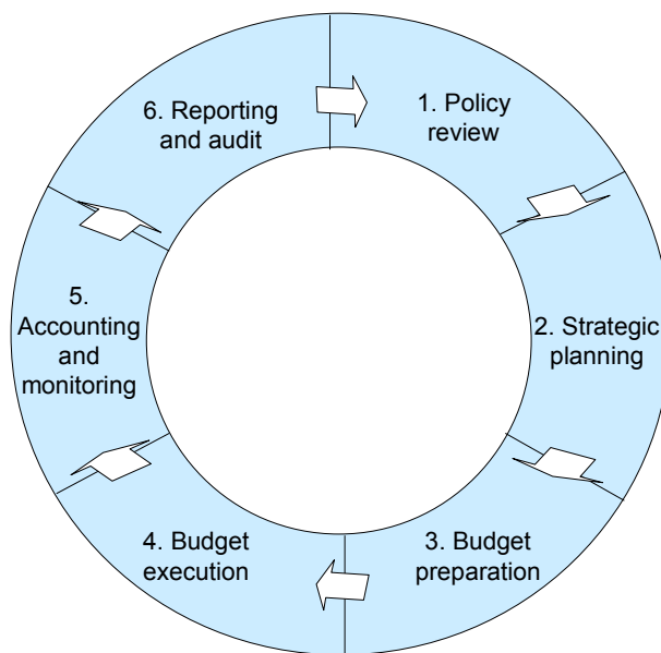
Figure 2: The Public Financial Management Cycle

120. Thinking holistically about the links between components of the PFM cycle helps in choosing effective safeguards, for example